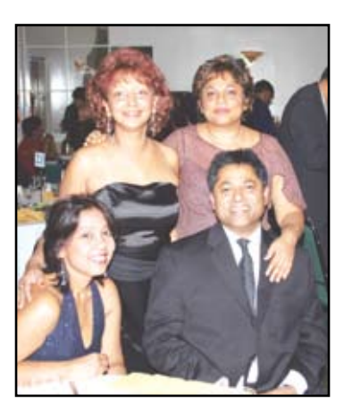
Highlights from the Christmas Dinner & Dance