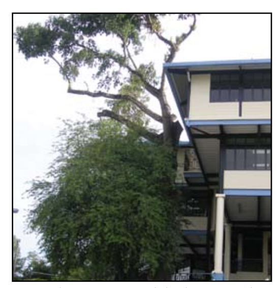
NGHS alumnae expressed shock at seeing their favourite tamarind tree hacked and now surrounded by concrete and asphalt. Will it survive?