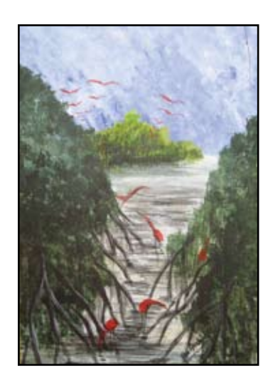
Original Oil Paintings by Ian Ali