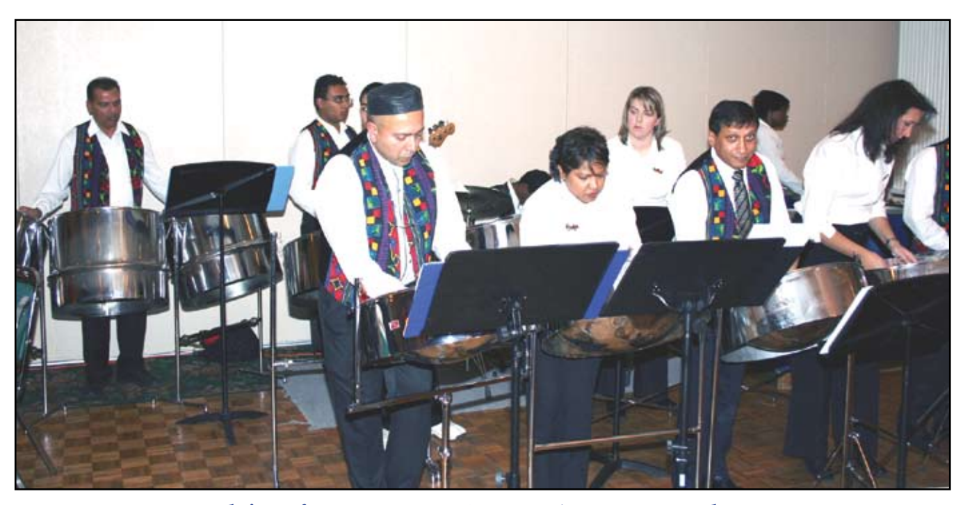
Panache's performance at XMAS Dinner & Dance, November 2005.